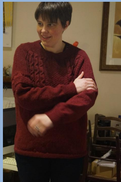
Here's one knitted by my wife, with the Caister pattern (Norfolk).