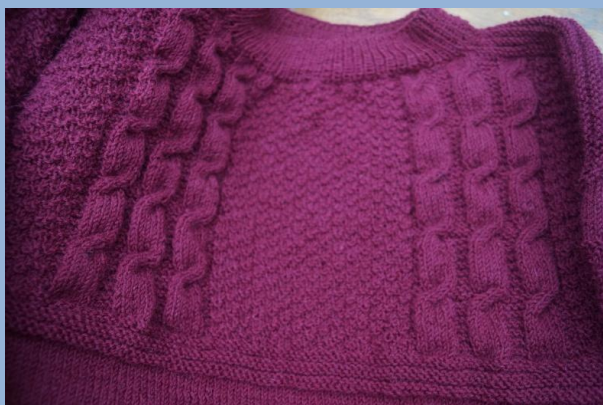
Close-up of the Caister pattern