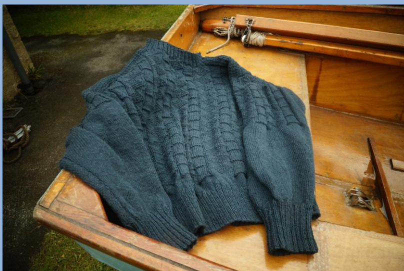
This one, also by my wife, shows the Flamborough pattern.

The home of the gansey is Flamborough Marine , who sell proper ganseys in various sizes and colours, as well as gansey kits for you to knit your own. There's also more information on their site.