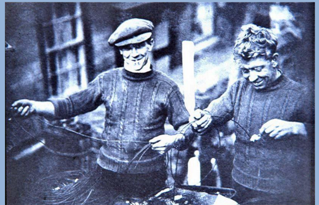
The Lunn brothers of Robin Hood's Bay, as immortalised in the Leo Walmsley books, wearing ganseys.

needles for the sleeves and, traditionally, four or five needles for the body. The modern method is to use a circular needle for the body.